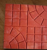
ROUND & SQUARE