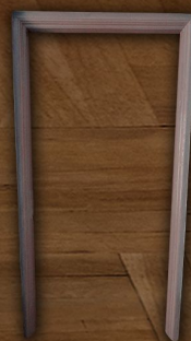
DOOR FRAME 125 mm x 60 mm