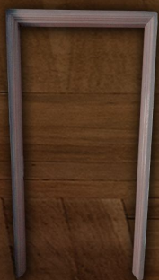
DOOR FRAME 125 mm x 60 mm